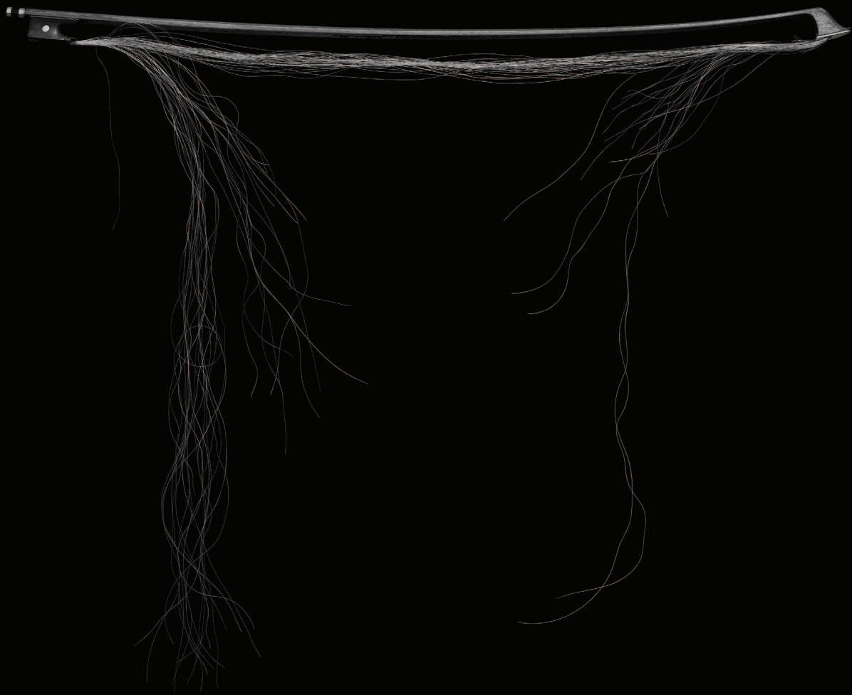
Broken Bow 2013 Pigment print 60 x 87 in 152.4 220.98 cm