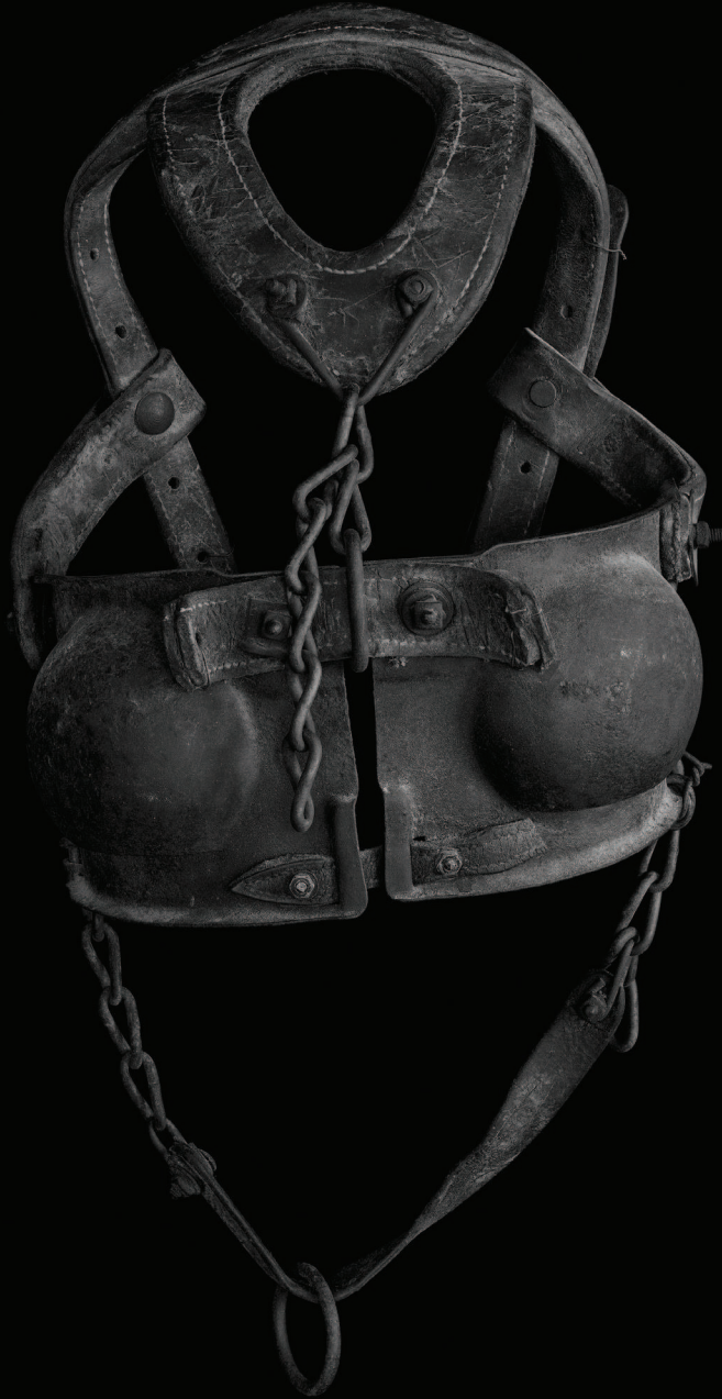
Bull Blinders 2009 Pigment print 64 x 44 in 162.56 x 111.76 cm