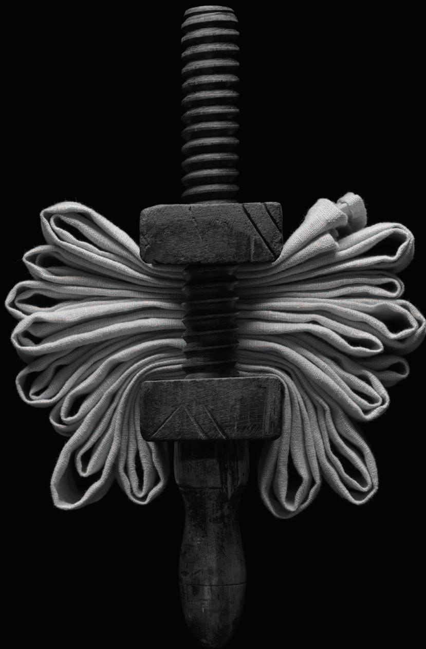
Clamp and Shroud 2013 Pigment print 44 x 33 in 111.76 x 83.82 cm