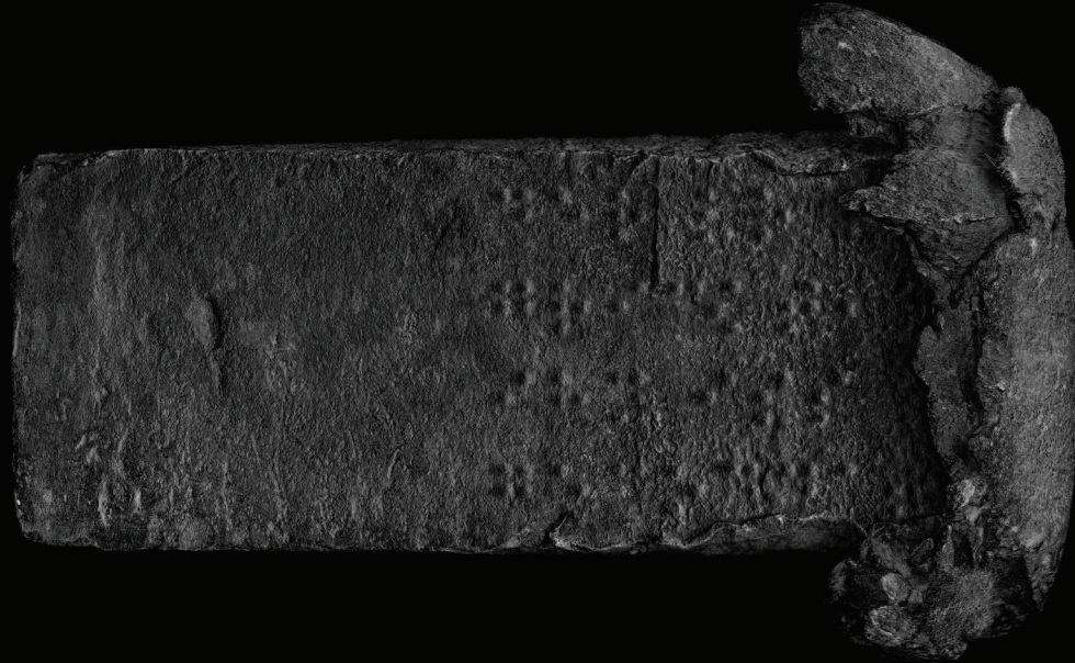
Iron Wedge 2011 Pigment print 33 x 44 in 83.82 x 111.76 cm