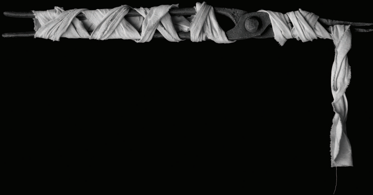
LEFT Weaning Halters 2009 Pigment print 60 x 60 in 152.4 x 152.4 cm