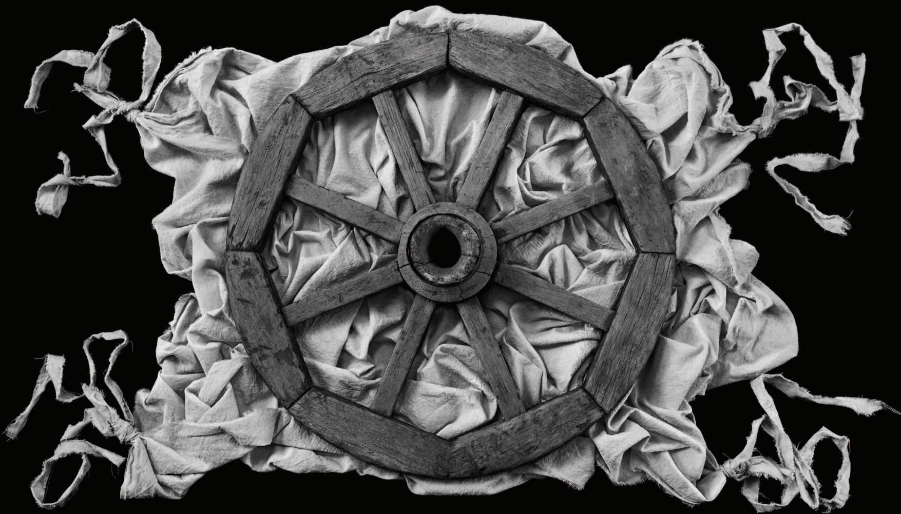
Wheel I 2008 Pigment print 60 x 87 in 152.4 x 220.98 cm