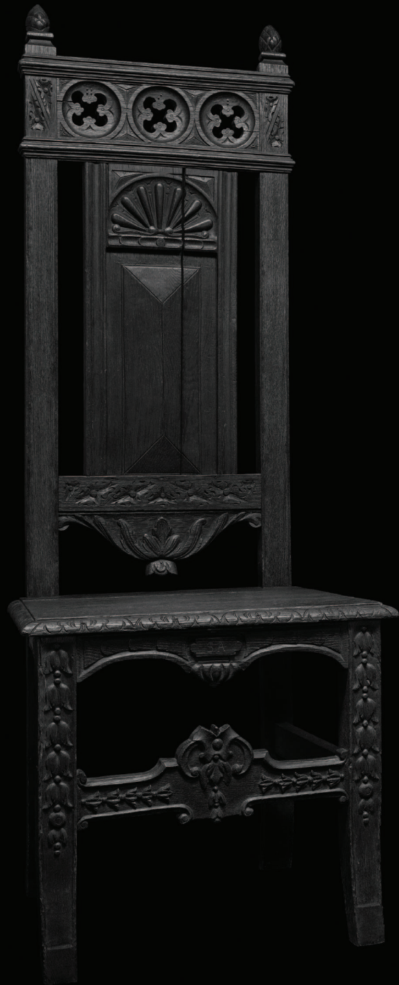
Chairs Diptych 2015 Pigment print 95 x 60 in (ea.) 241.3 x 152.4 cm (ea.)