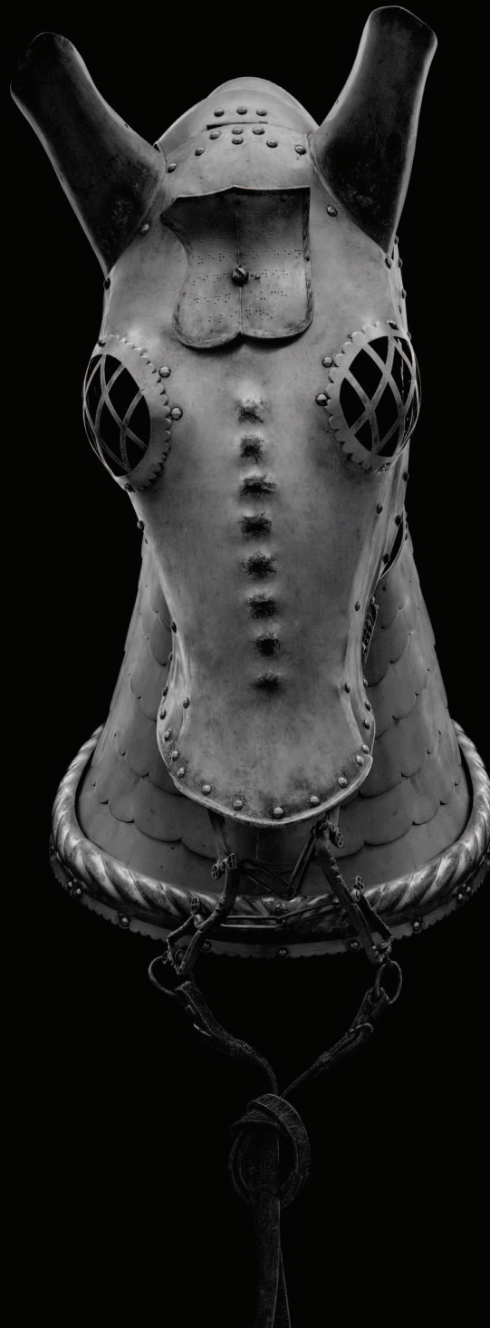
Knot III (horse armor) 2011 Pigment print 87.5 x 60 in 222.25 x 152.4 cm